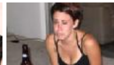
Click here to view her Photobucket album