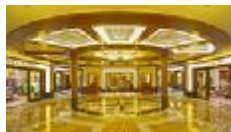
Latest shots from Disney's new cruise ship