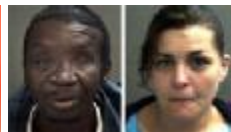
Orange County Jail booking mugs -- updated daily