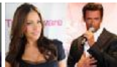
Some of these may surprise you