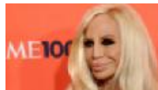
Celebrities addicted to plastic surgery